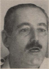
AIR FORCE MINISTER

and tried to intercept it, dropping down from 20,000 feet to where it was flying at